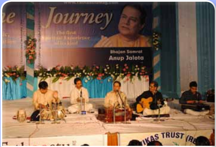
Anup Jalota sang divinely.